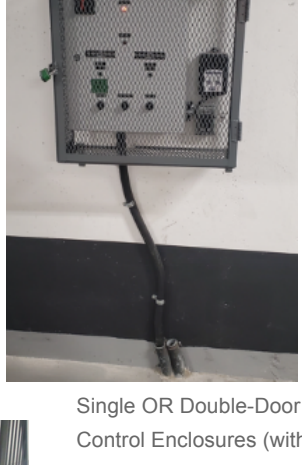
Control Enclosures (with expanded mesh)