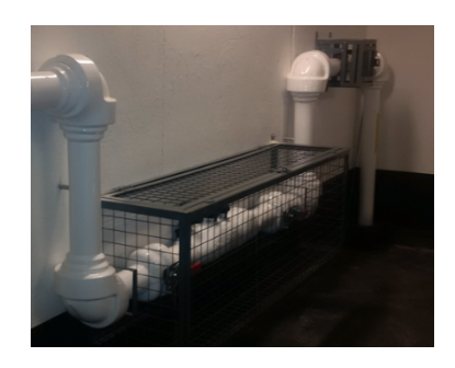
Pipe Enclosures with Access Doors

Press Fan and Stairwell Fencing with Access Door