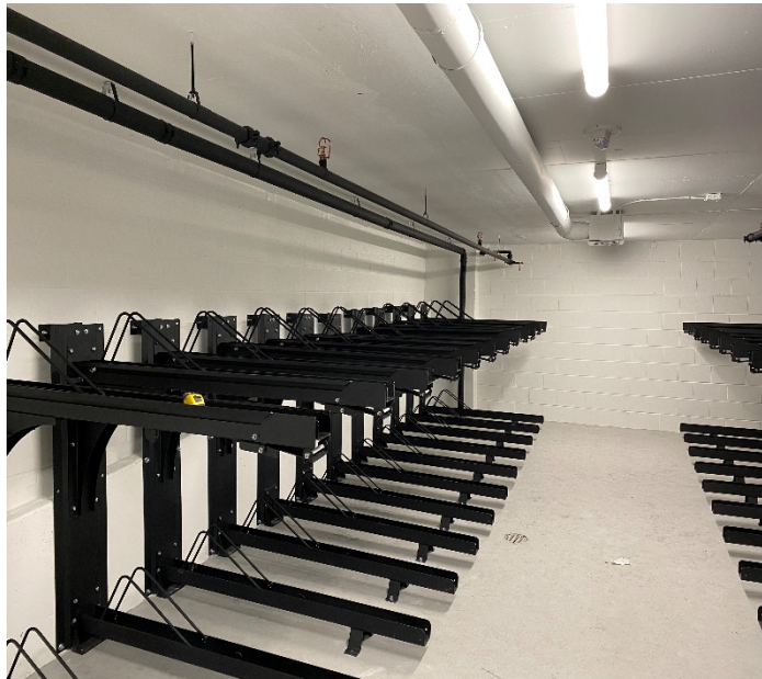
Wall Mount Stackable System

Rugged. Structurally Sound. Built to Last.