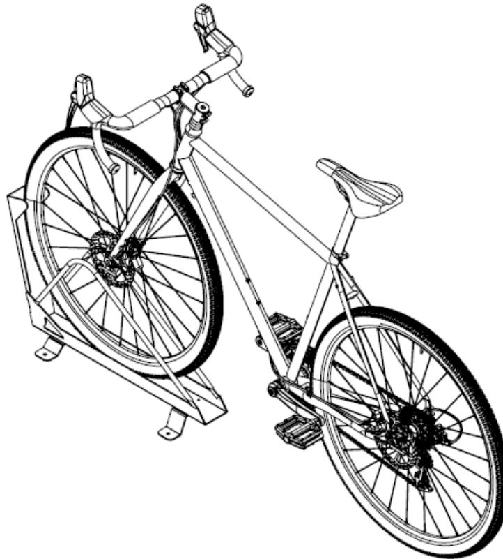
Single Horizontal Floor Mount